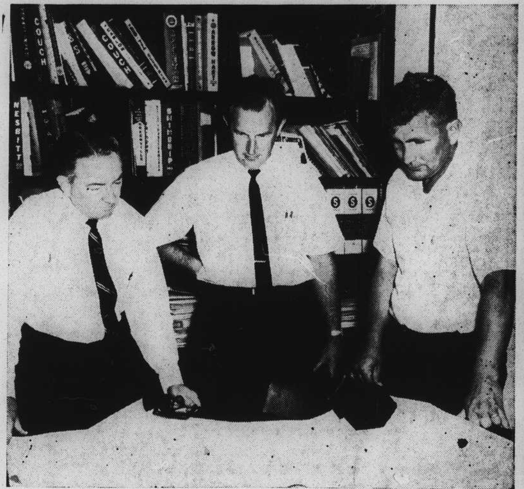
DISCUSSING THE PLANS and specifications for the new plant of Brevard's prize-winning weekly newspaper is the group above in the office of the Bryant Electric company, the builder. From left to right,

The Times is recognized for winning many state and national awards. In fact, during