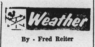
By - Fred Reiter

The Times is happy to make this clarification for the commissioners.