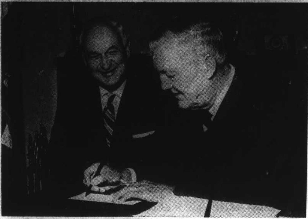
GOVERNOR DAN K. MOORE is pictured endorsing United Fund campaigns for North Carolina with