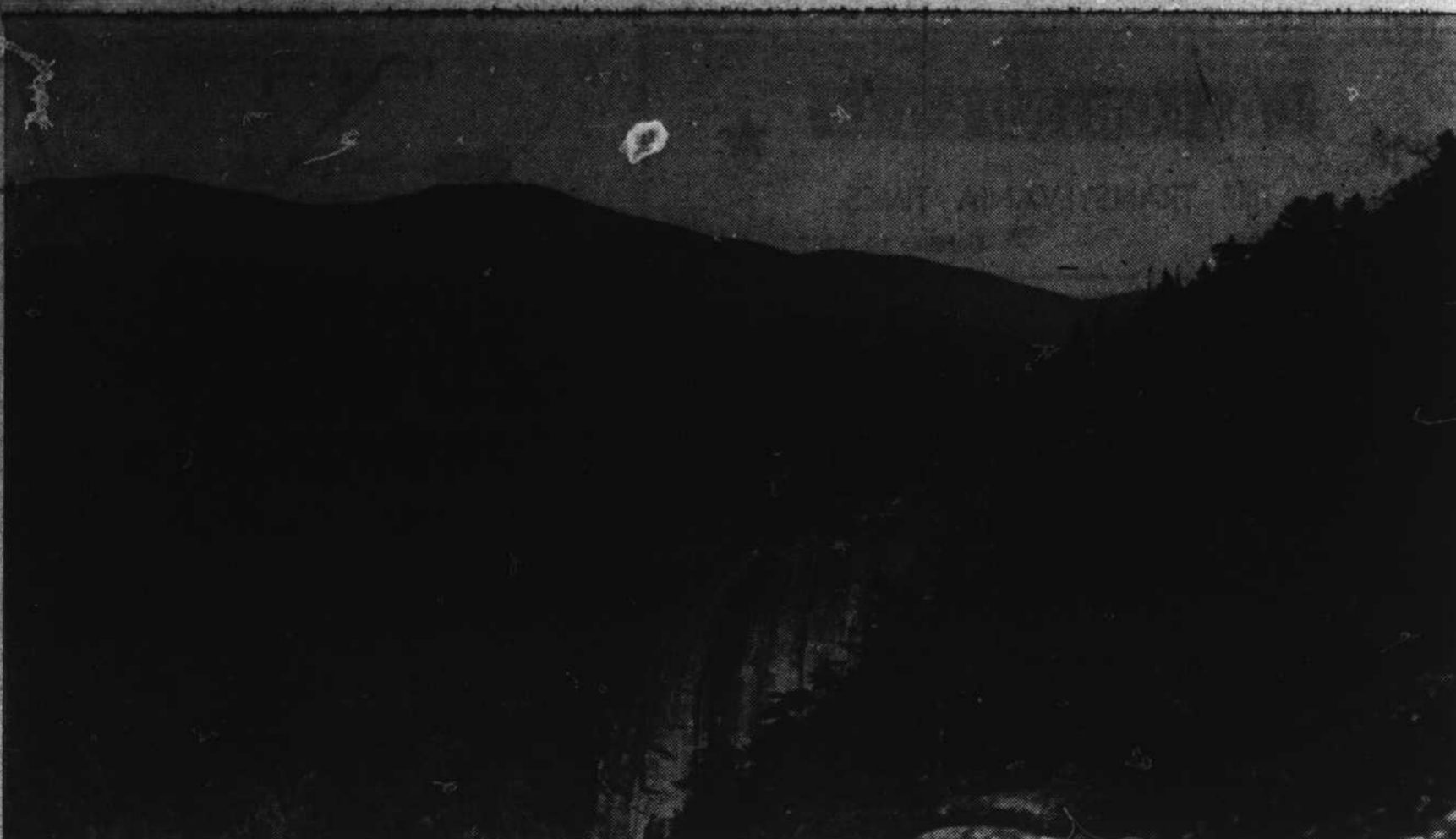
Pictured above is a scene typical of the Brevard area, if one can label such a view typical. The beautiful mountain setting is a major factor in most students' decision to attend Brevard College. Many classes will graduate from BC before the