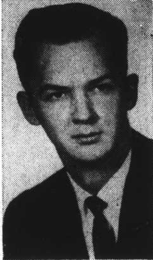
an Adjutor for two years.