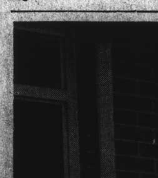
NEW LAKE TOXAWAY POST OFFICE DEDICATION