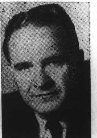
CONGRESSMAN ROY A. TAYLOR will be the principal speaker at the regular meeting Thursday night of the Brevard Kiwanis club. It will be held in Gaither's Rhododendron room, beginning at 6:45 o'clock.

Listener's comments are always welcomed regarding this —Turn to Page Three