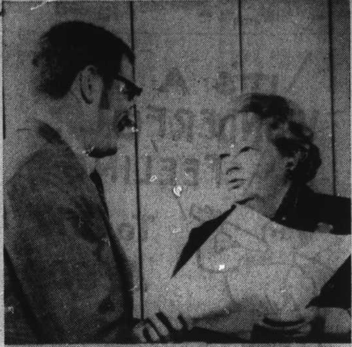
45th Annual N.C. PRESS INSTITUTE CHAPEL HILL