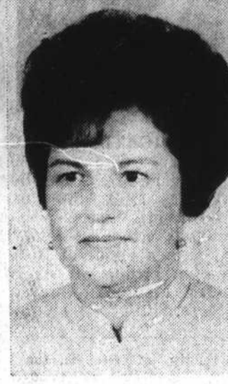
FOR BOARD OF EDUCATION —The three Republicans in the running for the Board of Education nominations are pictured above. At