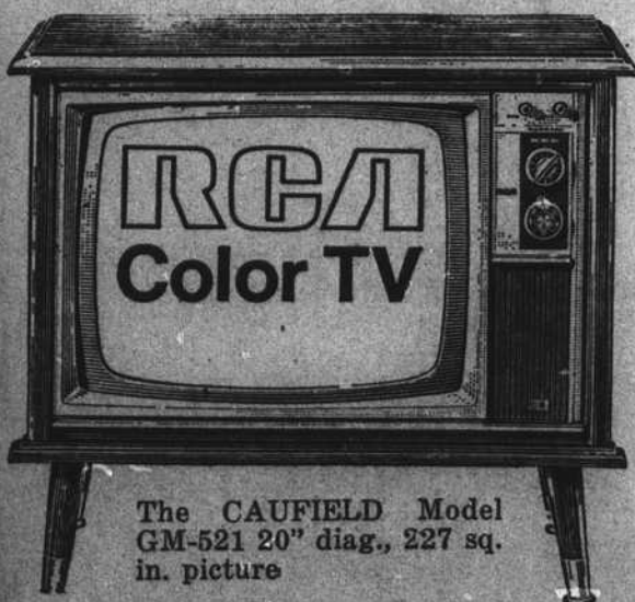
The CAUFIELD Model GM-521 20" diag., 227 sq. in. picture

value-priced console color in compact size