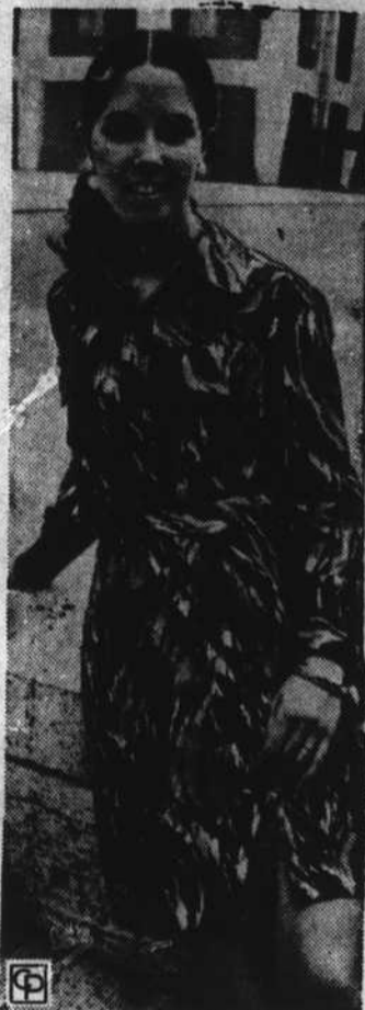
COMFORTING — Swirl's "Wear-Now" coatshirt from the Spectator collection is in tones of gold and brown on polyester and cotton.