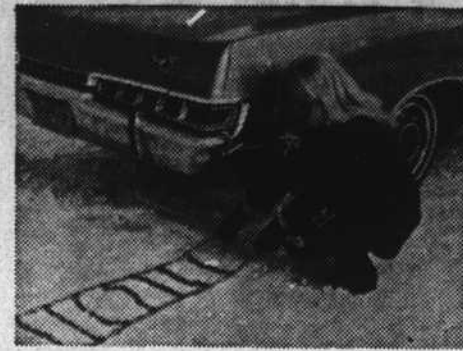
STEP NO. 1 Spread the chains on the ground behind the rear wheels to remove tangles. Hooks should be to the rear. Reinforced chains are best and the projecting teeth or cleats should be facing up.

With a little "know-how" and practice, it can be done in 6 minutes, without a jack and without getting your clothes dirty.