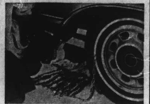
STEP NO. 2 Gather the chains behind the tire so they won't catch the fender, and attach the end links to the "chain applicator," a simple spring steel wire that is easily slipped onto the tire.