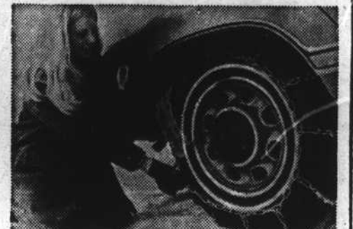
STEP NO. 4 Remove the applicator and fasten the inside hook first, then the outside hook. With a little practice the inner hook can be fastened by "feel" without getting under the car.