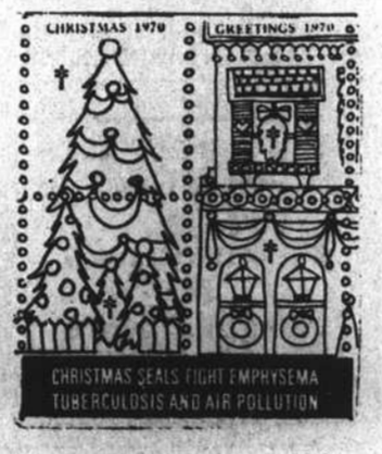
CHRISTMAS SEALS FIGHT MPRYSMA, TUBERCULOSIS AND AIR POLLUTION