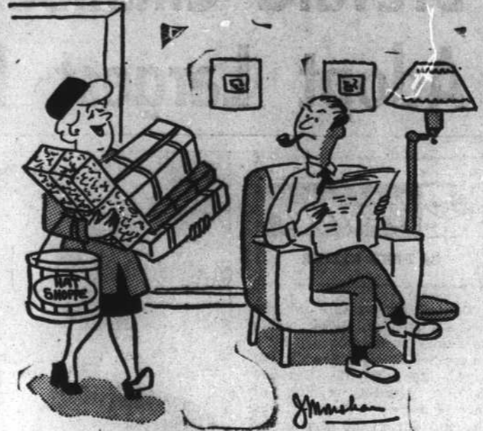
© King Features Syndicate, Inc., 1970. World rights reserved. "I would have bought something for you, but I didn't know your necktie size."

Hamilton Electric Motor Service 339 King Street Brevard