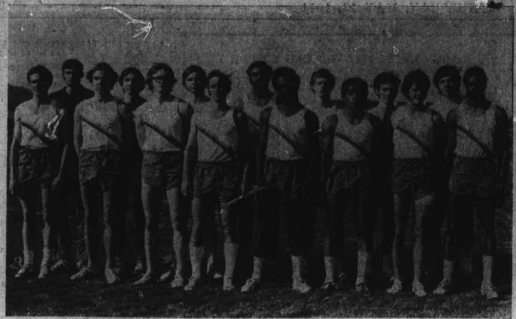
BREVARD'S FINE TRACK TEAM is the recent winner of the Regional meet held here.

May 14 Western Regional -- Brevard May 21 State Track Meet -- Raleigh