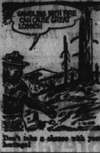
Don't take a chance with your belongings!