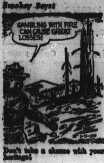
Don't take a chance with your backlogs!