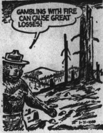
Don't take a chance with your heritage!

When in need of job printing, call The Transylvania Times.