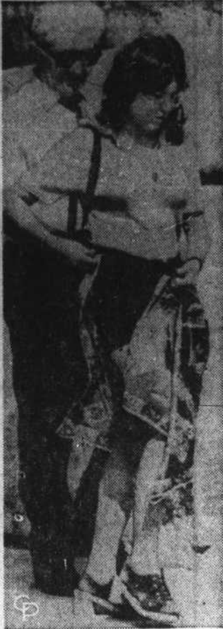
CHURCH CLOTHES - A father helps his daughter wrap a scarf around her shorts-clad derriere so she can be admitted to the Vatican in Rome. The bars are up against physical display.

Having a limited amount of type it took Johann Gutenberg five years to hand set and print the Bible. Today the entire volume can be composed electronically in 77 minutes.