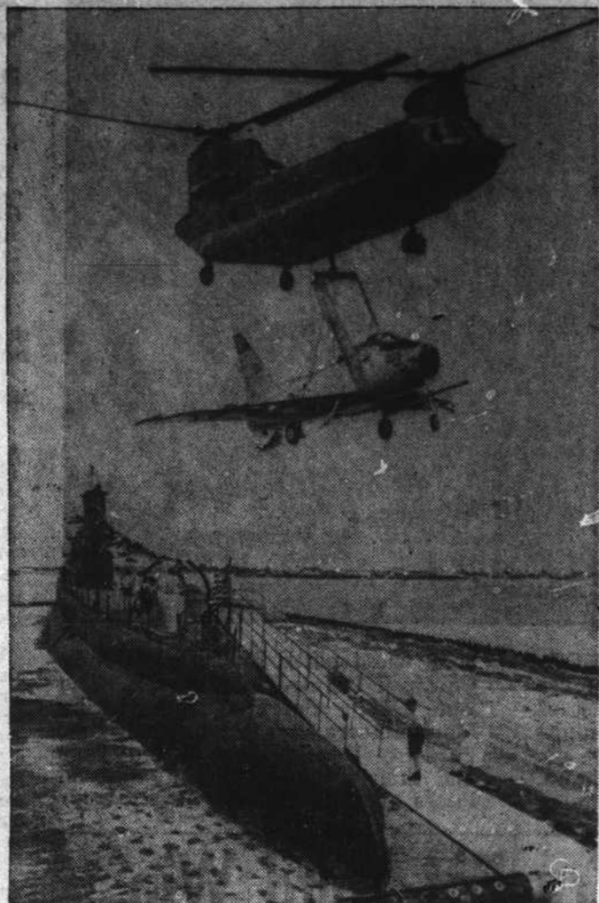
LAI'D TO REST—U.S. Army Chinook helicopter gently lowers a U.S. Navy F-1E fighter jet at the Sea Wolf Memorial Park in Galveston, Tex. The plane will be on display next to the submarine U.S.S. Cavalla.

Keep Tuned To W P N F 1 2 4 0 On Your Dial "WONDERFUL PISGAH NATIONAL FOREST"