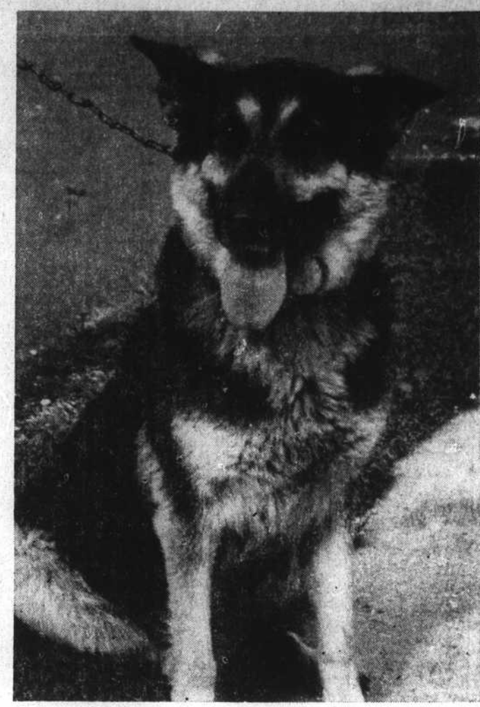
"BOW-WOW" in the language of this beautiful German Shepherd means: "I want a home and I want to be loved". Anyone who is eager to fulfill these two requirements please call the Humane Society at 883-2577. This organization is one of the 15 agencies supported by the United Fund.

They had a basketball game at Pleasant Gardens School and then enjoyed a hamburger supper.