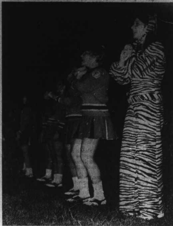
CHEERLEADERS cheer Tigers on to a Big Conference VICTORY!

The TIGER DEN has a varsity locker room and showers, a J. V. locker room and showers, a ball equipment room, a coach's office, a trainer's office and two rest rooms. The flooring is of desert marble, colored with orange and black tiger stripes. Upon entering the right outside door, you will see a beautiful tiger's head embedded in the flooring of the varsity dressing room. A whirlpool is located in the J. V. dressing room to aid injured players in getting back in top playing shape.