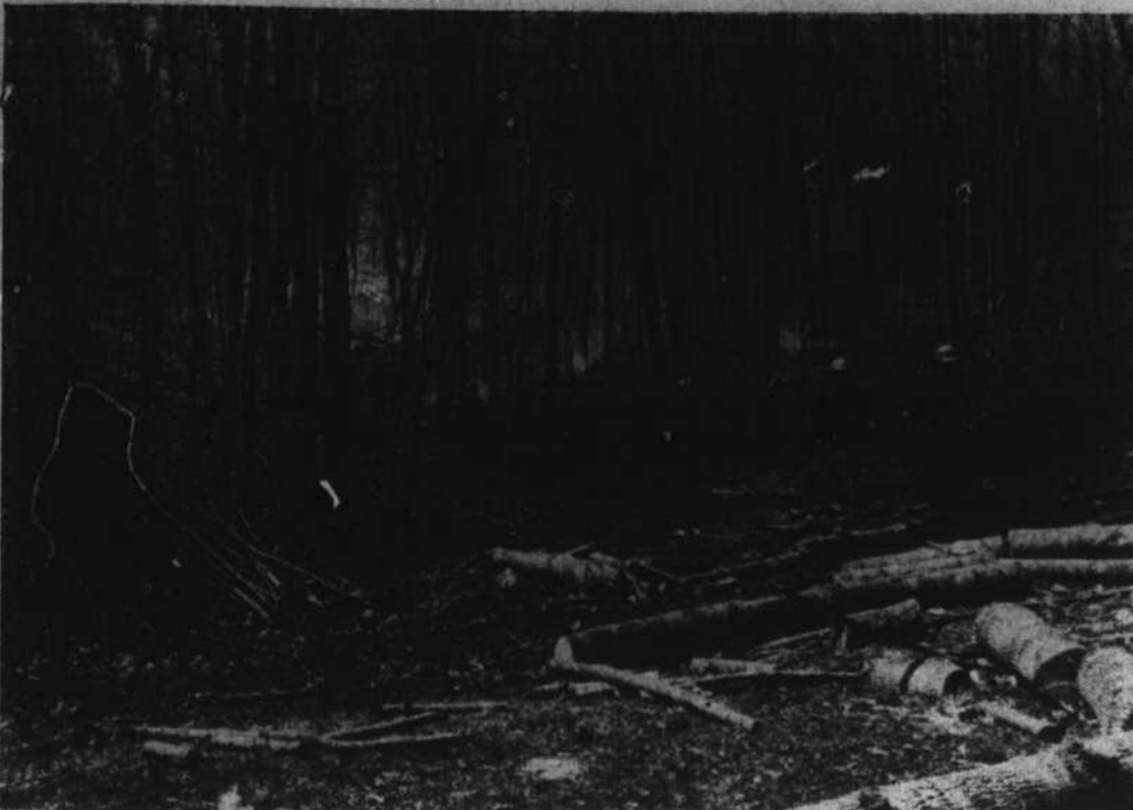
HELPING IN AN EMERGENCY — Schenck Civilian Conservation Camp Corpomen fight Cat Gap Fire on the Brevard Watershed — which is a part of the Pisgah Ranger District near Brevard.