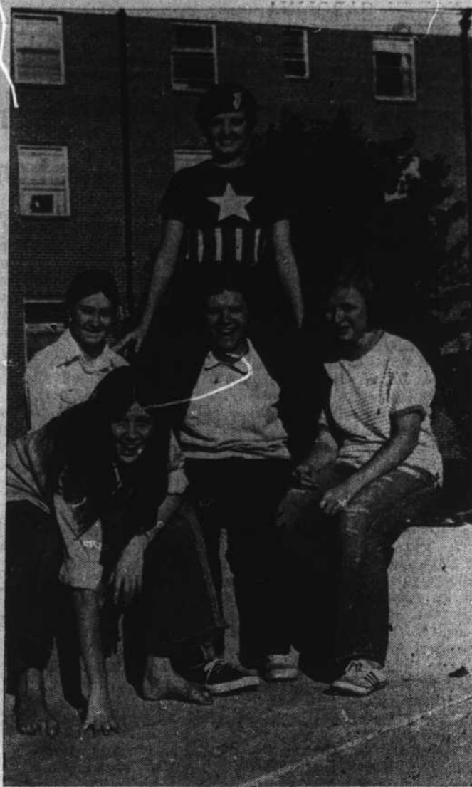
A GROUP OF NEMOS inspect their paint job on the pool between Jones and Beam at Brevard College.

Presently there are 30 summer programs and 34 full year