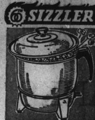
3 Qt. Popcorn Popper Electric See through lid Handsome aluminum