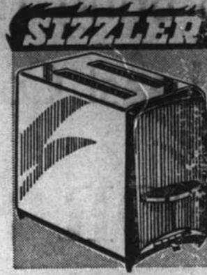
Wizard Toaster 2-slice toaster with automatic thermostat control!

COME IN AND REGISTER FOR FREE Console Color TV ★ Open Thu. & Fri. Nites For Your Shopping Convenience at Western Auto Store