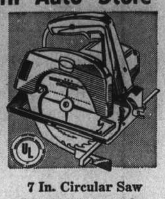
7 In. Circular Saw Powerful 9-amp, 1 1/4 hp motor! Safety clutch to prevent burnout. Chute to eject sawdust! 10-lbs.