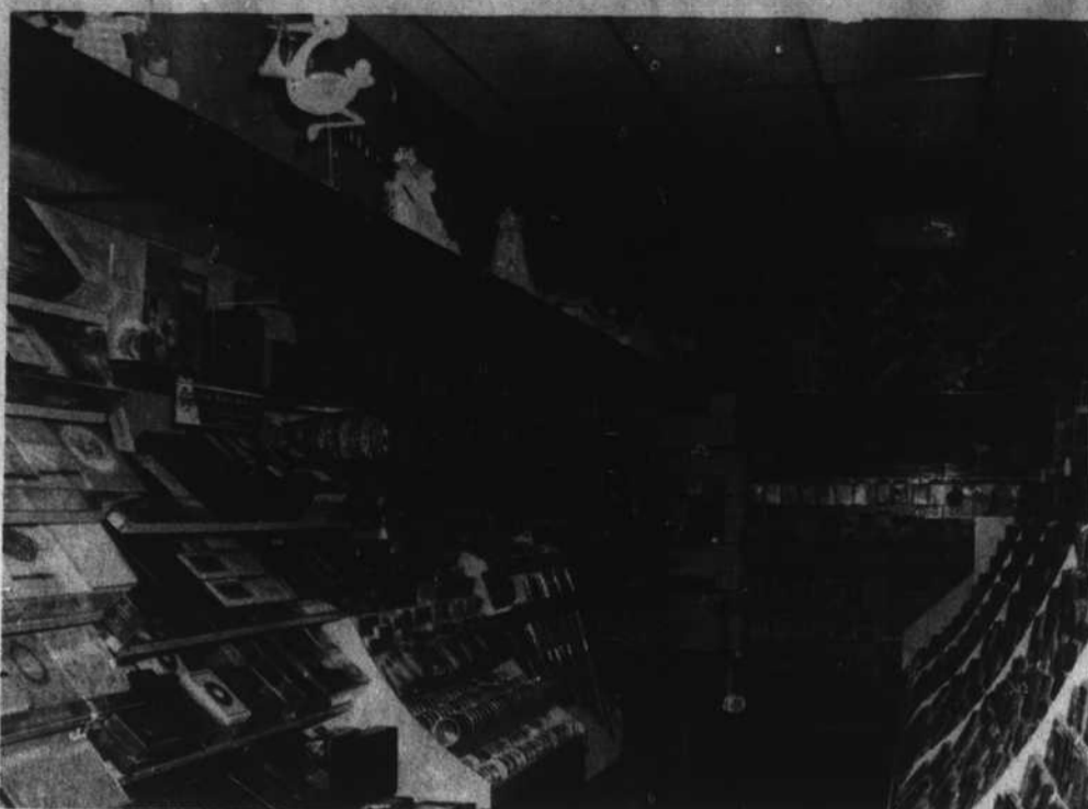
ONE OF THE DEPARTMENTS in the new Ward's is pictured above. The beautifully remodeled firm on East Main street will have a Grand