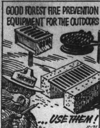
Suggestions to prevent forest fires!