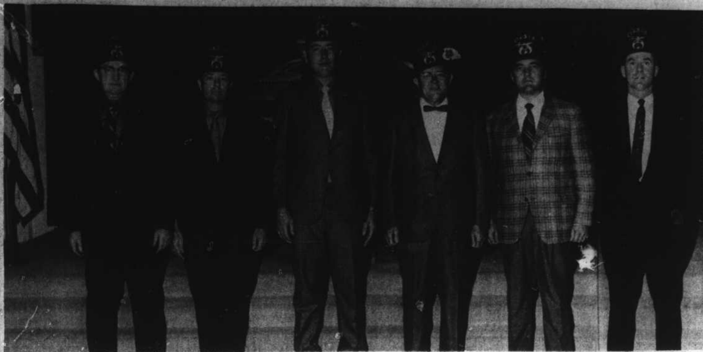
NEW TRANSYLVANIA SHRINERS — The largest class from this county since 1943 was initiated and became members of Oasis Temple, Charlotte, at a recent Fall Ceremonial held in Asheville. The class was named the Asheville 1971 Class. Pictured above, left to right, are:

Vol. 84—No. 48 BREVARD, N. C., THURSDAY, DECEMBER 2, 1971 ★ SECTION TWO ★