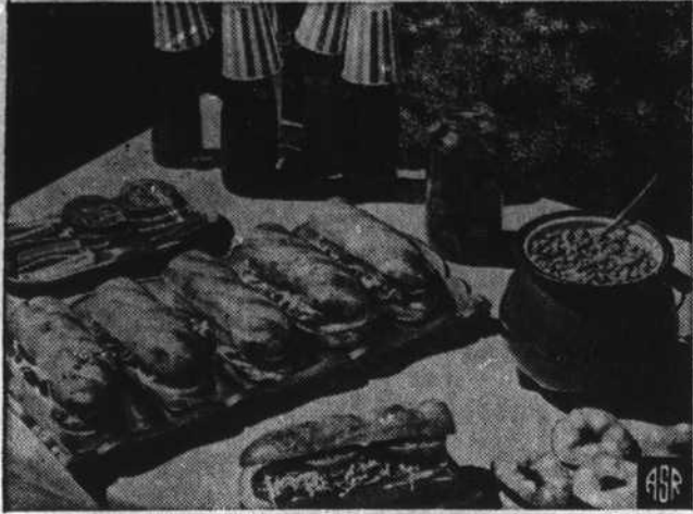
Hot Chili-Vegetable Submarine Sandwiches, a different idea for a holiday party-picnic.

This is one of the best times of the year for a picnic. The weather is getting gloomier every day, and what better way to perk up spirits than with good, old-fashioned summertime fun?