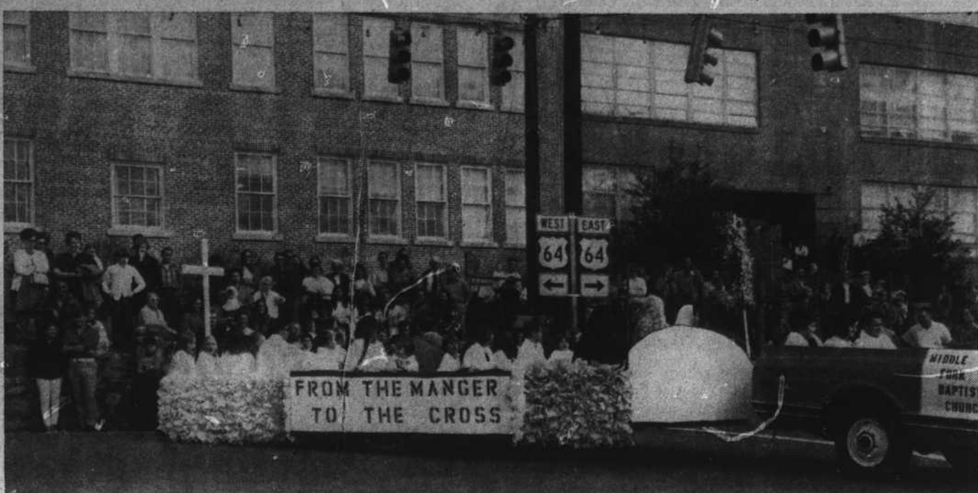
ANOTHER PRETTY FLOAT in the Christmas parade at Rosman last Sunday afternoon is pictured above. The theme of this float was "From

TO OUR MANY FINE CUSTOMERS FROM THE SMART SHOP Now Open Each Evening Until Christmas West Main St. Dial 863-4810 Brevard Located Right Across from the Co-Ed Theatre