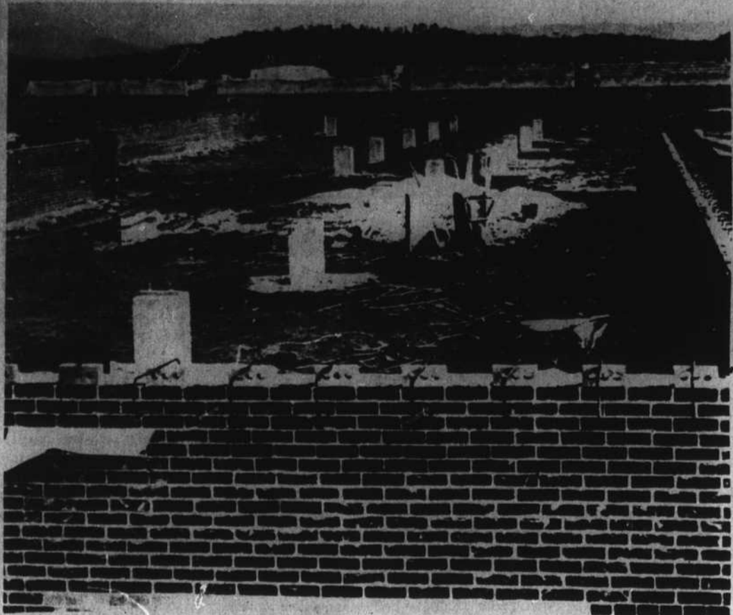
FOOTINGS AND FOUNDATIONS spread over the vast area that will be occupied by the new Transylvania Community Hospital on the

★ Vol. 84—No. 52 BREVARD, N. C., THURSDAY, DECEMBER 30, 1971 ★ SECTION TWO ★