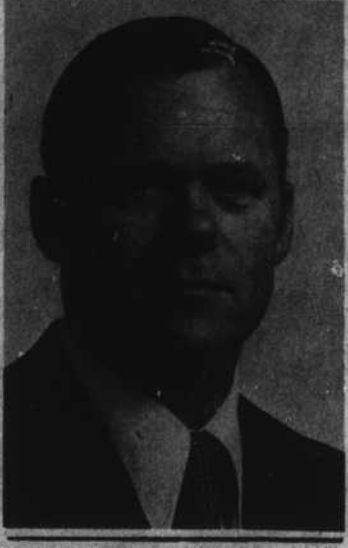
Management at Frostburg State College. He is a native of Davenport, Iowa, and served

A graduate of Illinois State University, he later worked toward a Master's degree in