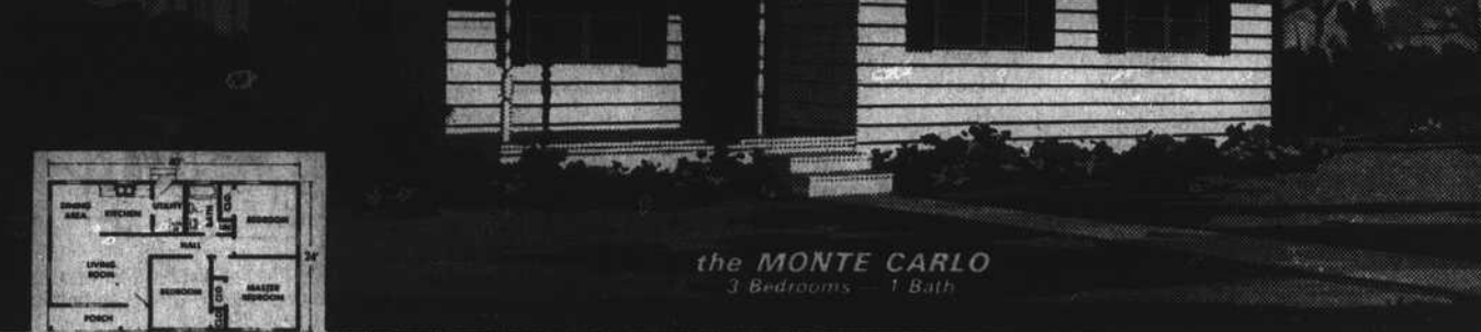
the MONTE CARLO 3 Bedrooms 1 Bath