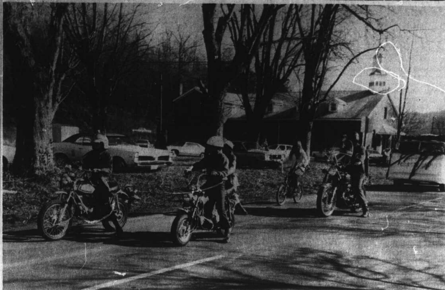
MECHANICAL HORSES IN PARADE —Shown here are some of the young cyclists in Rosman's Christmas Parade December 9th. Beside the road are a few of the hundred or more cars that brought spectators to the unusually well attended Christmas attraction. Zion Baptist Church is in the center right background.