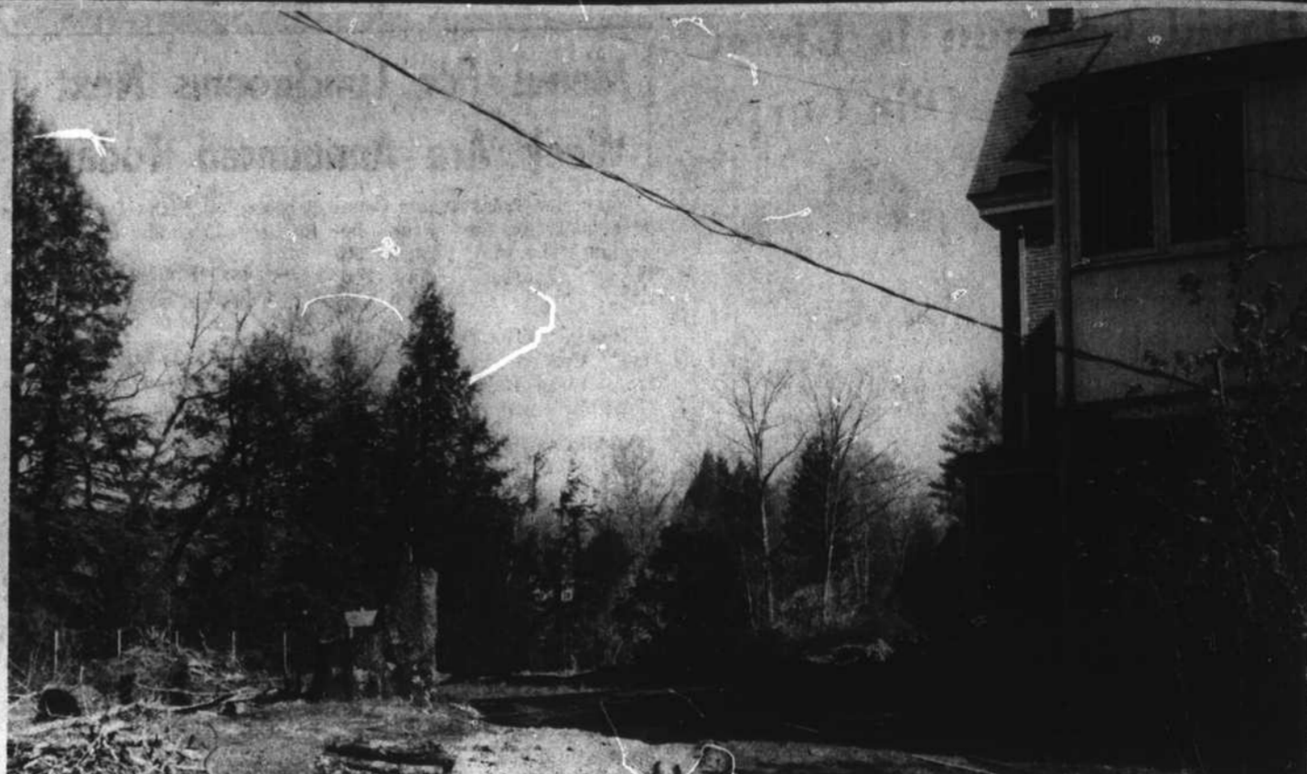
County industrialist. Photo on the right, above, shows the west side of the mansion and the area, background, where the tennis courts are being built. Photo below is the area on the east side of the mansion where the picnic area is being built. (Times Staff Photos)