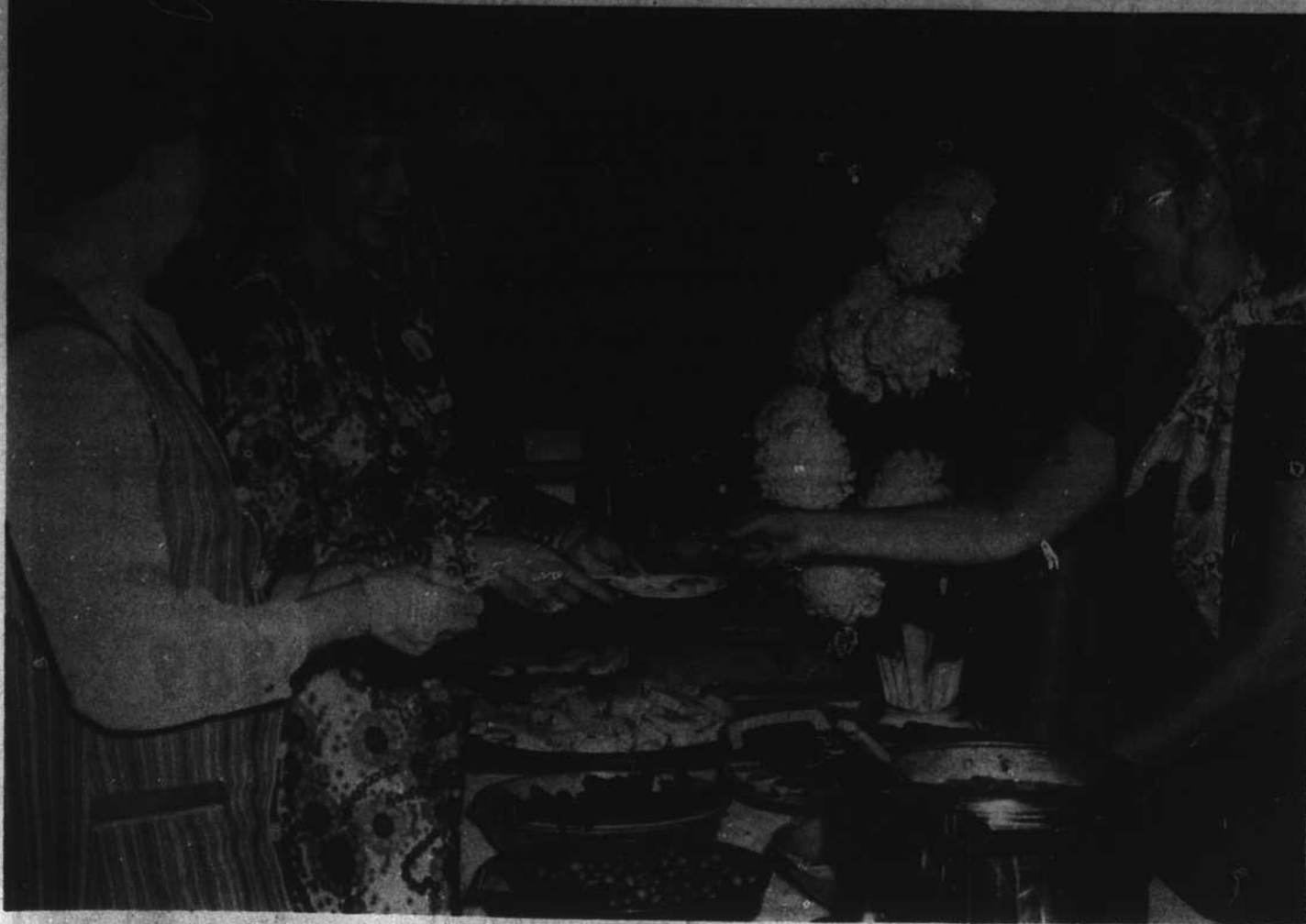
OPEN HOUSE AT OLIN last weekend was declared a huge success as thousands of Transylvanians took advantage of the opportunity to tour the Pisgah Forest facilities of the huge industrial complex. In the photo above left, a small portion of those attending are shown outside the huge tent that served as a welcome center during