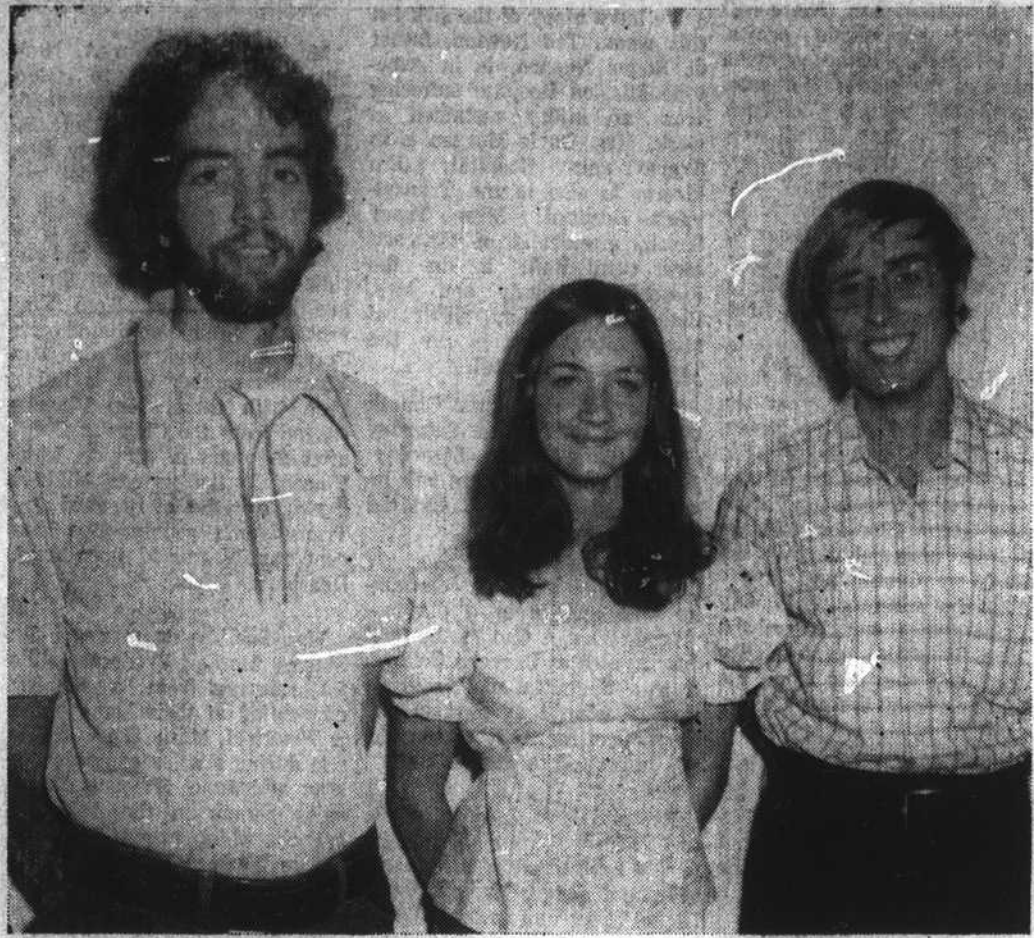
MISSION WORK TEAM TO COSTA RICA — The three young people in the photo above represent the 12 members of a Methodist Work Team that recently spent a month in Costa Rica helping with