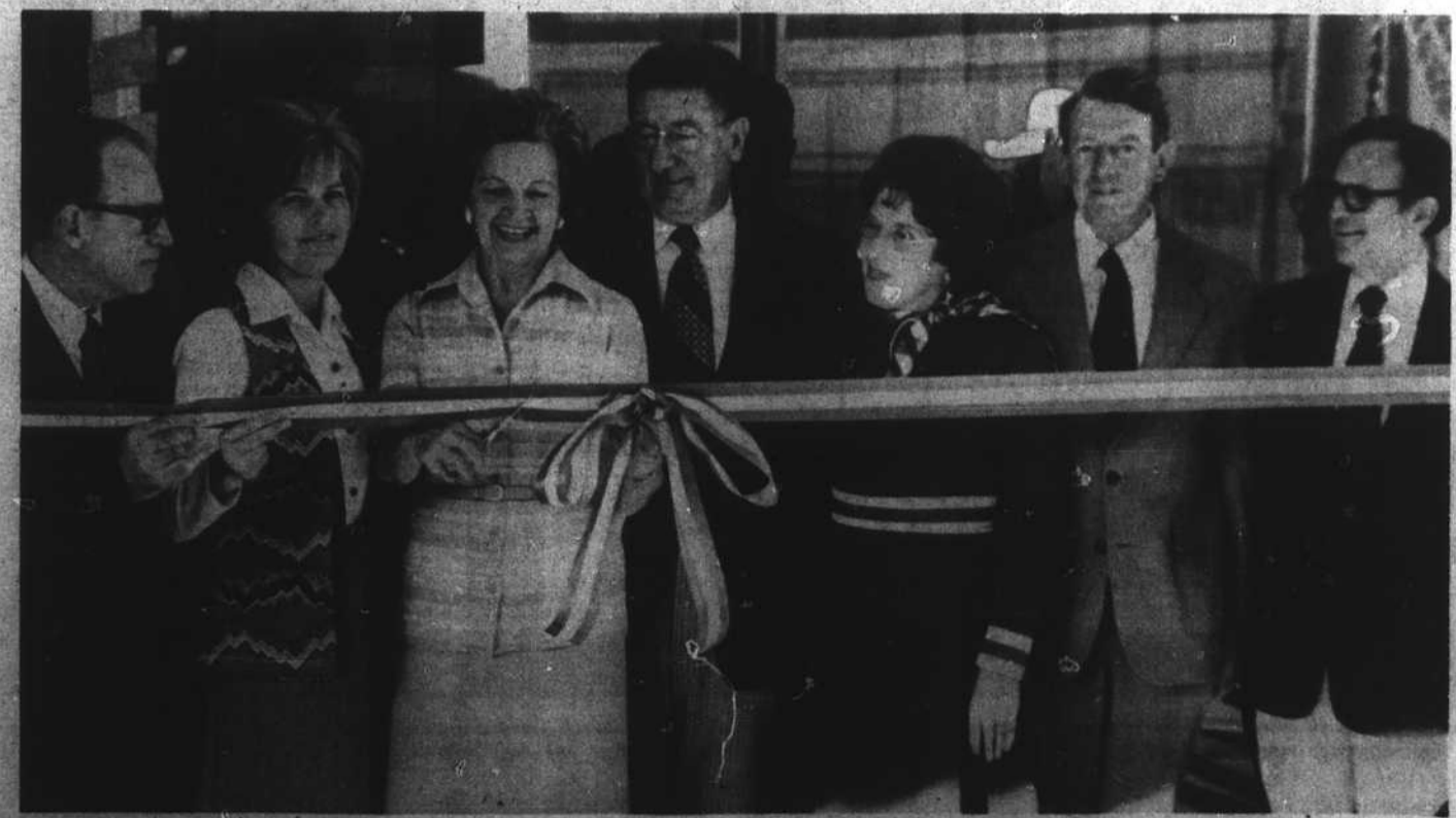
DEMOCRATS OPEN HEADQUARTERS — Some 100 Democratic candidates and supporters gathered Monday afternoon to officially cut the ribbon opening the campaign headquarters on West Main Street in Brevard. They later went to a rally at T.C. Henderson School at Quebec. Pictured cutting