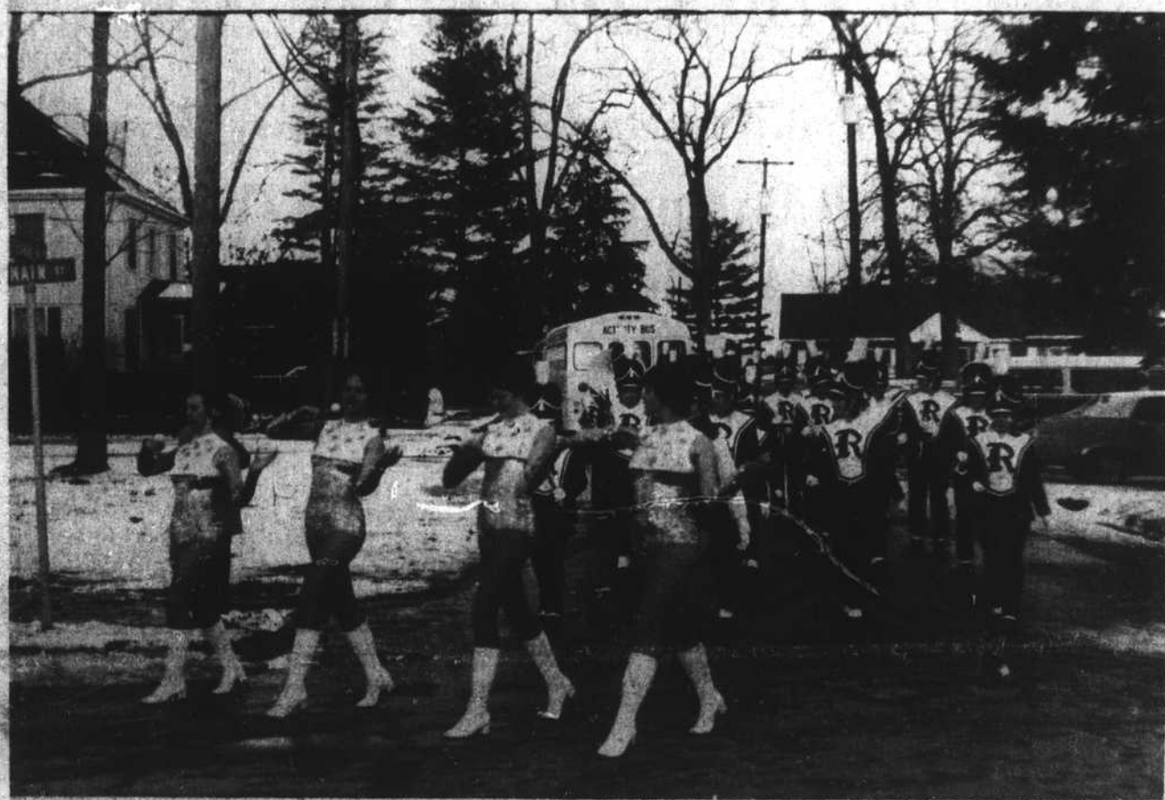
Rosman High's Band Begins Long March