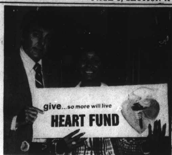
TV PRIVATE EYE MIKE CONNORS, MANNIX, is as concerned about fighting the nation's number one killer — heart disease — as he is about fighting crime on TV. Connors and his Gal Friday (Gail Fisher) urge Americans to give generously to their Heart Fund. Both are celebrity Heart Fund volunteers. Connors served as 1971 Honorary Heart Sunday Chairman for the Los Angeles area.

When you think of prescriptions, think of VARNER'S. adv.