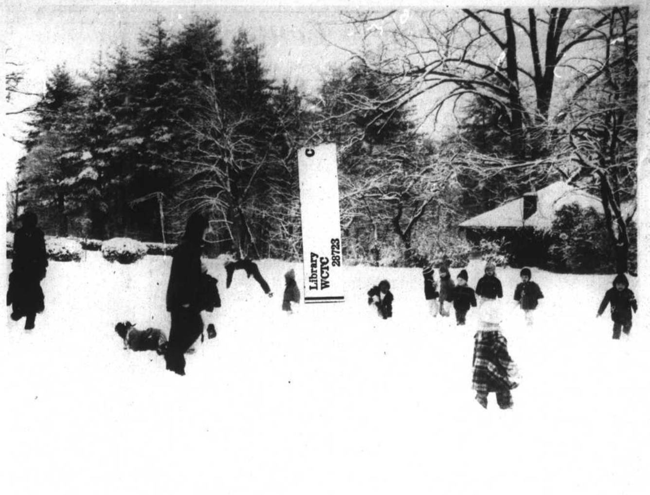
THE SNOWS CAME — Transylvania residents, and those in other areas of Western North Carolina awakened Monday morning to find the ground covered with snow, quite a

surprise since rain had been predicted. The slick roads caused a flurry of minor auto accidents, but at midday no personal injuries had been reported. School was called off for the day, and