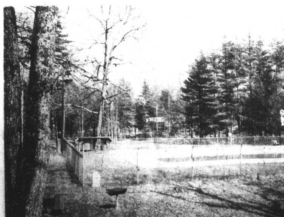
FRANKLIN PARK — Awaiting many improvements.

Franklin Park has been leased from Transylvania County for a period of 50 years for the sum of $1 a year.