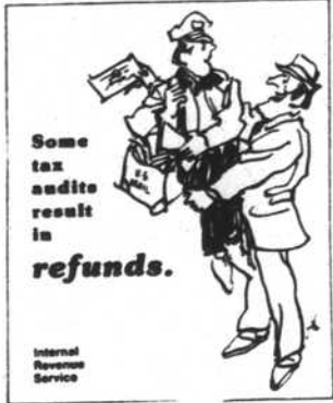
Some tax audits result in refunds.