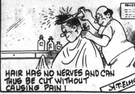
WHEN ONE'S HAIR IS CUT, WHY DOES IT NOT HURT? HAIR HAS NO NERVES AND CAN THUS BE CUT WITHOUT CAUSING PAIN!