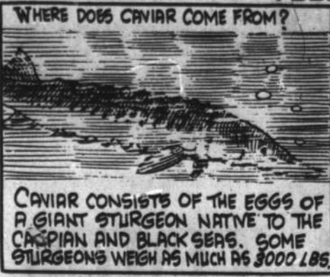
WHERE DOES CAVIAR COME FROM? CAVIAR CONSISTS OF THE EGGS OF A GIANT STURGEON NATIVE TO THE CASPIAN AND BLACK SEAS. SOME STURGEONS WEIGH AS MUCH AS 3000 LBS.