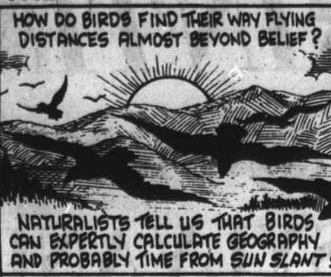
HOW DO BIRDS FIND THEIR WAY FLYING DISTANCES ALMOST BEYOND BELIEF? NATURALISTS TELL US THAT BIRDS CAN EXPERTLY CALCULATE GEOGRAPHY AND PROBABLY TIME FROM SUN SLANT!