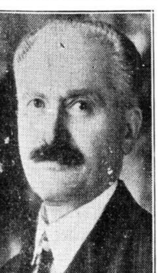
NEW and numerous unpublished picture of President Albert Lebrun of France. M. Lebrun stands in the center of vast unrest, as Fascists and Communists clash repeatedly in his country.