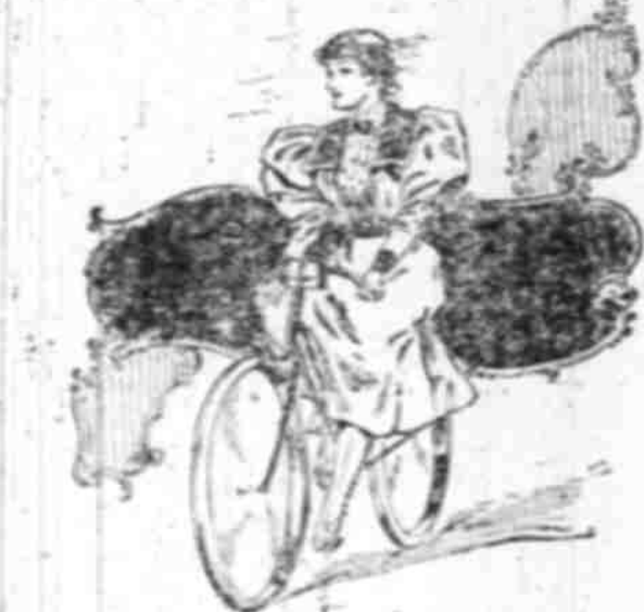
I got this from HATHAWAY BROS.