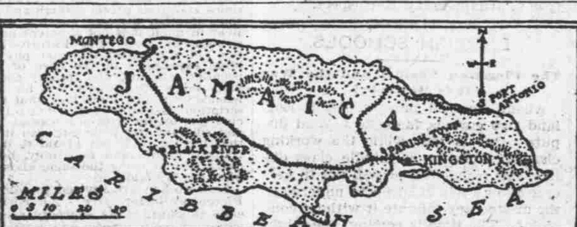
MAP OF THE ISLAND OF JAMAICA.

As recently as 1906 seers on the | Mercantile business in Kingston is | investment of as high as $50,000, sland made the solemn prophecy that | conducted | largely by Scotchmen, | line the streets to the north of the within two years the city would be while the tobacco trade, which is ex- city. They are all shielded from the forebodings, however, Kingston has stores are large and very similar to overhung with palms had a steady growth and improve- those to be found in an American