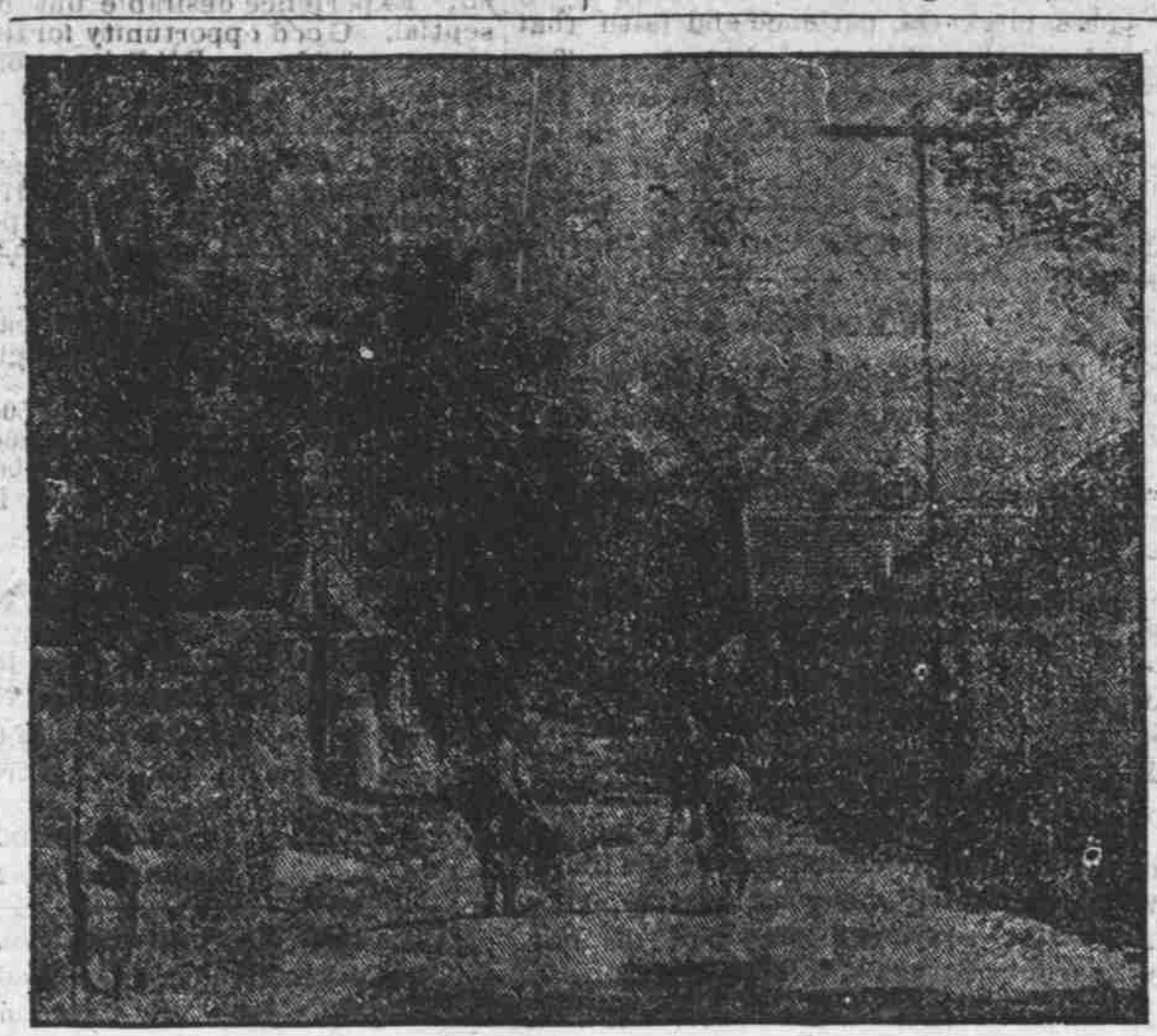
GORDON TOWN, IN THE BLUE MOUNTAINS OF JAMAICA.

It is situated on the south coast are low, are built of stone and brick, year after the destruction of Port and on the north side of the harbor, and the business blocks are of brick Royal, across the bay, it is on a plain | the latter being a land locked basin | and never more than three stories in