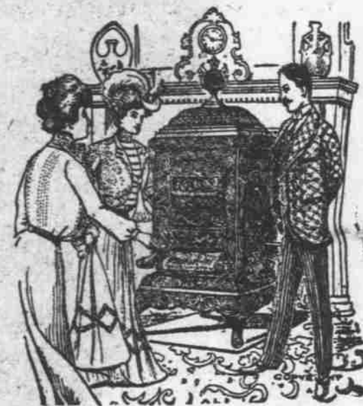
Heating Stoves, Coal and Wood from $1.50 up.