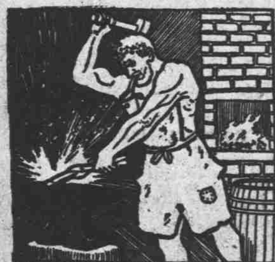
Horse Shoes at $4.25 in keg Lots. Wagon Material.

Steel Traps, all sizes. Cross-cut Saws, Log Chains. Axes, Etc.