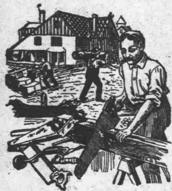
Tools of all Kinds at the right prices.

UNION STOVE CO., Inc., Box 2745, RICHMOND, VA.