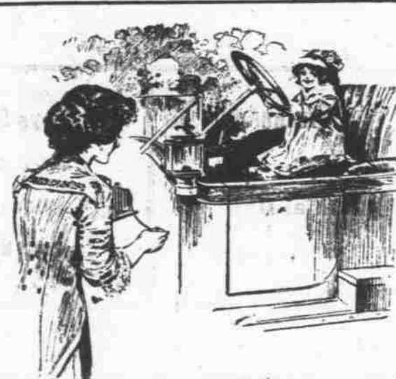
"If it isn't an Eastman it isn't a Kodak."

Among the many attractive and useful Christmas Gifts, A KODAK holds first place, for people of all ages delight in using them, and in our display you will find the dainty little vest pocket Kodak, at $6.00. The practical and popular 3-A. at $20.00. Brownies from $1.00 up, and many others, to suit ability and pocketbook.