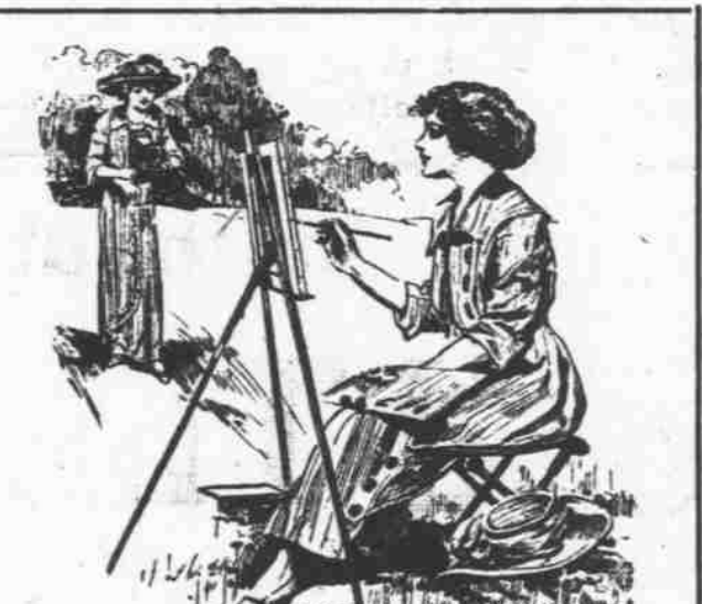
A Kodak Helps in Art.

Sets of OIL AND WATER COLORS, with the great variety of materials for painting, make appropriate gifts for this season, and our selection of all the newest in this line cannot fail to please.