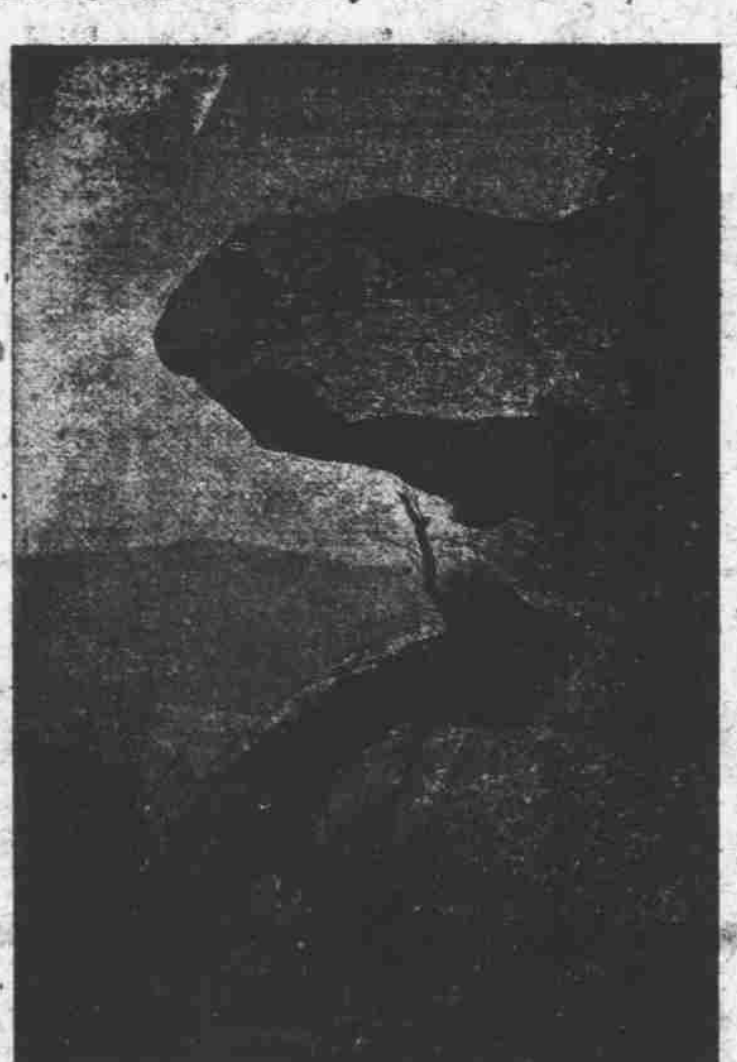
Typical Mountain Scenery.

From an industrial standpoint Hendersonville has a live city council and two com-