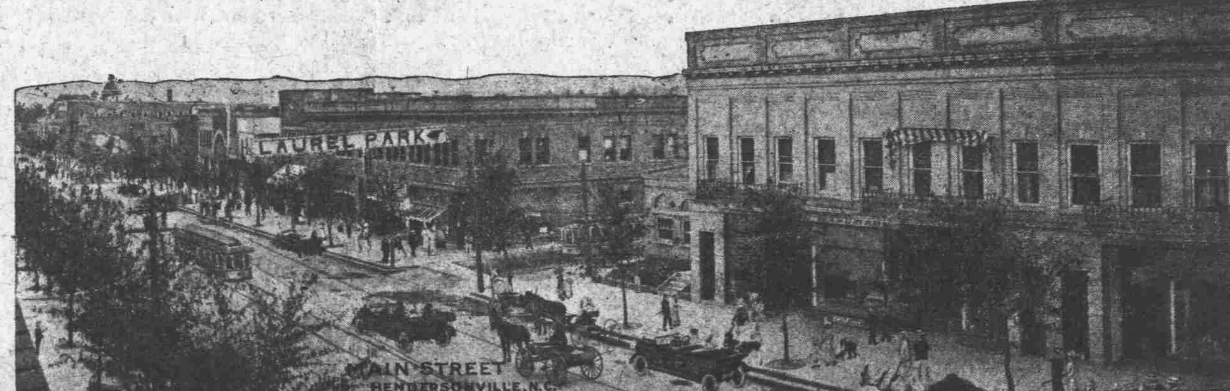
Main Business Thoroughfare, Hendersonville, N. C.

Hendersonville and Henderson county have live progressive citizens, who will welcome the farmer, capitalist, manufacturer, tourist, home-seeker, mechanic, and all dosirable persons who will come and live