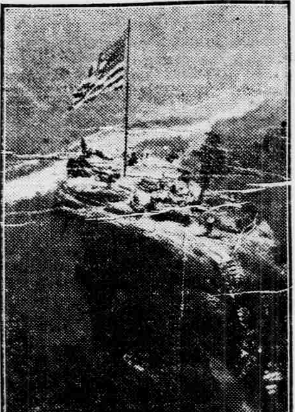
Where Electric Lights Make Stars Jealous.

rock overhanging nothing but atmosphere was brilliant with many soft lights, the many paths, the very bowels of the monstrous rock itself was illuminated with little globes of light. The effect, seen from the highway, may not be described. There is but one thing to do—go see it. The memory of it all will stay with you during the coming years.